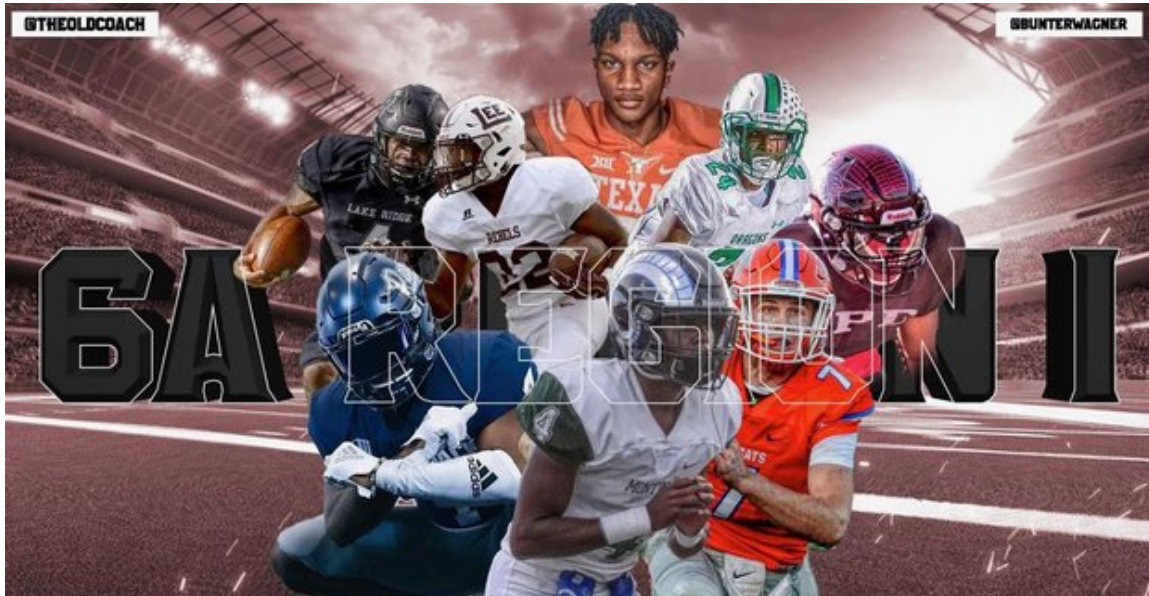
A handful of 6A Region 1's biggest stars.

With the offseason coming to a close, 6A Region 1 teams are gearing up for the 2018 season.