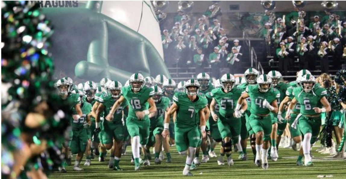
Southlake Carroll of District 5-6A taking the field in 2017.